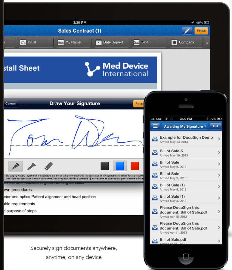
Securely sign documents anywhere, anytime, on any device